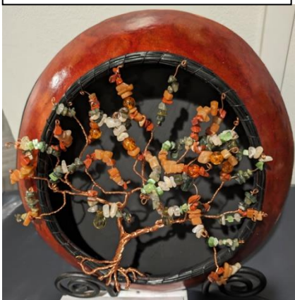
Item #19 Orange County