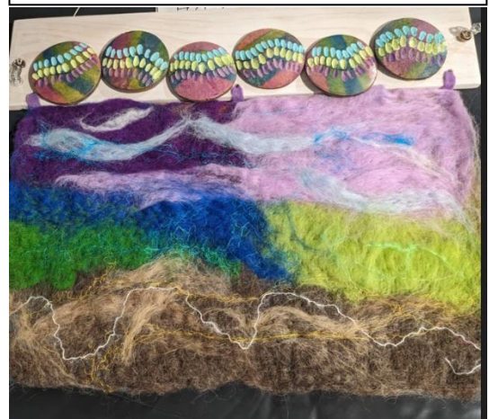
Item #18 Folsom