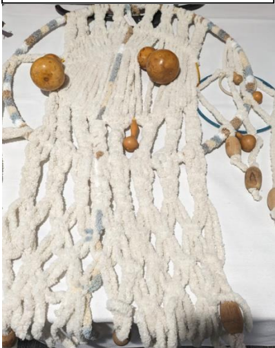
Item #29 Ventura