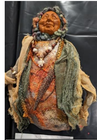
Item #4 Orange County