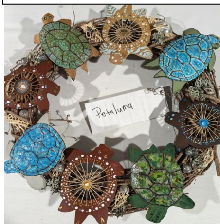
Item #20 Petaluma