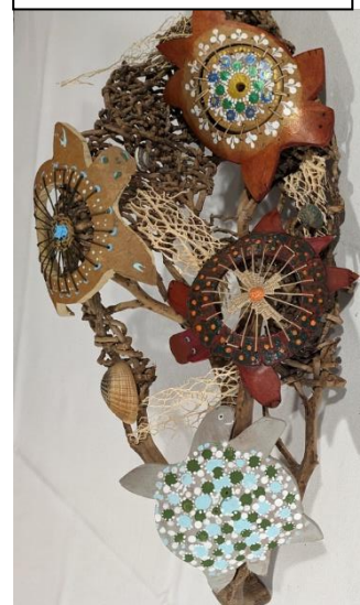
Item #21 Petaluma