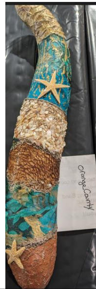
Item #3 Orange County