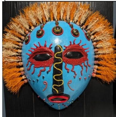
Item #30 Calabash