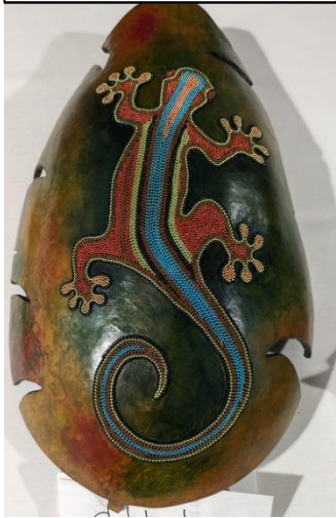
Item #26 Calabash