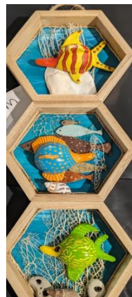
Item #13 Folsom