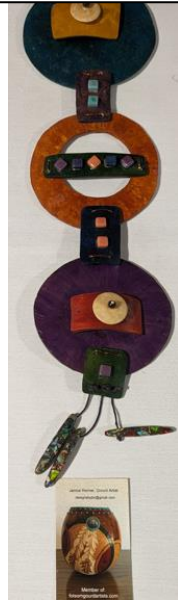
Item #27 Folsom