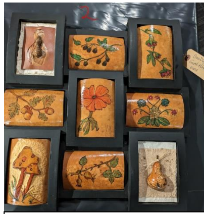
Item #2 San Diego