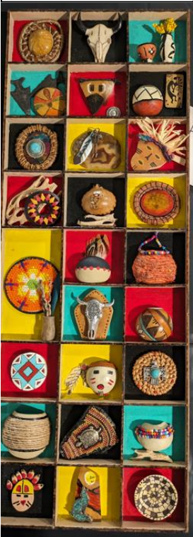
Item #14 Folsom