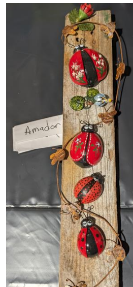
Item #11 Amador