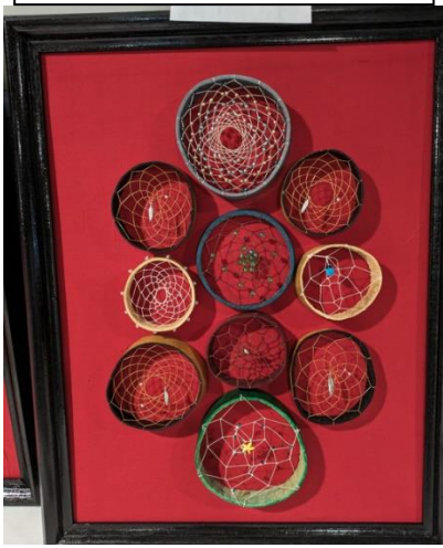
Item #23 Tulare/Sequoia