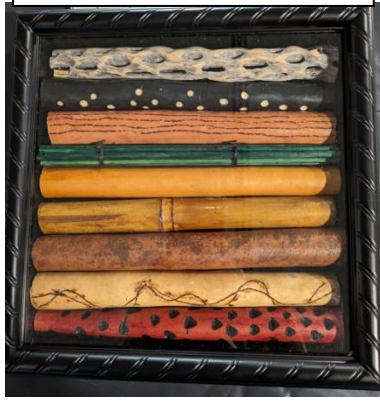
Item #15 Folsom