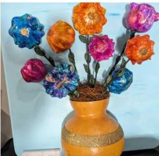
Item #8 Orange County