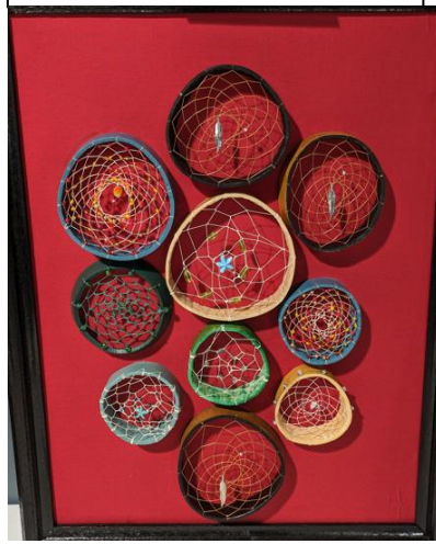
Item #24 Tulare/Sequoia