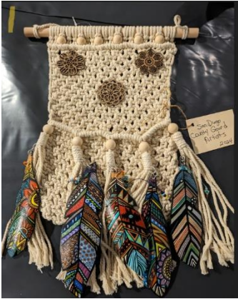
Item #1 San Diego