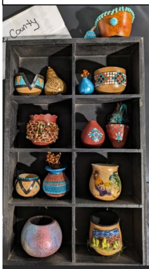
Item #17 Lake County