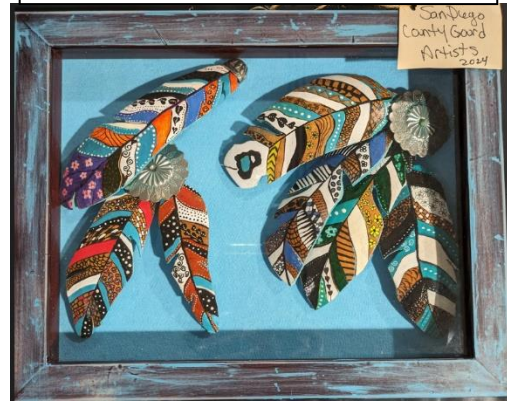
Item #16 San Diego