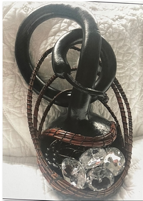
Above Weaving on Manipulated Black Gourd