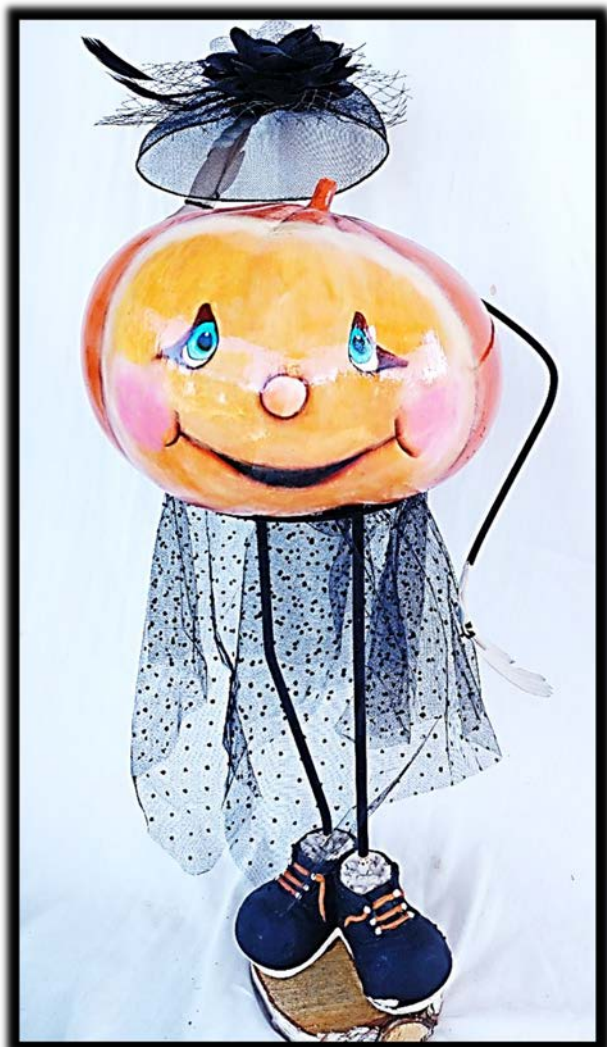
Day Of the Dead Made from a Kettle Gourd.

To the left, I have small jewelry gourds stacked on a great thrift store find! I sawed it in half, slid on the decorated gourds and used JB Weld to attach the metal back together.