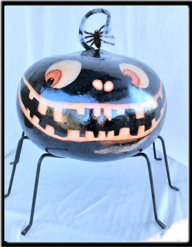
Above - For this very large Canteen gourd I used a spiderleg fixture I bought at Hobby Lobby some years ago.

I have a "thing" for antique bird cage stands and unique floor lamps. I get them when I can and store them for future projects.