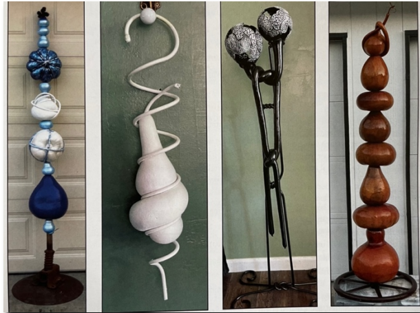
Above from left to right: Beauty & the Beast, White People Gourd grown in twisted metal, Double Whammy, and Ode to Jerry.