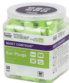
Flents Ear Plugs, 50 Pair, Ear Plugs for Sleeping, Snoring, Loud Noise, Traveling, Concerts, Construction, & Studying,...

Below are other suggestions for ear protection. All can be found on Amazon.