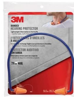
3M Safety Band Style Hearing Protector, Orange