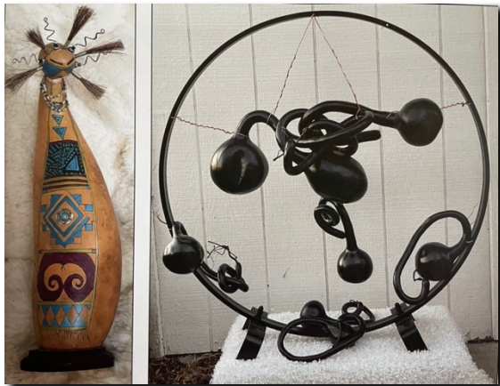
Above from left to right: Gourd Maiden and Gourds in Jumble. Below: Left, two knotted together and right, a special memory, 2019 Jim Story Winner