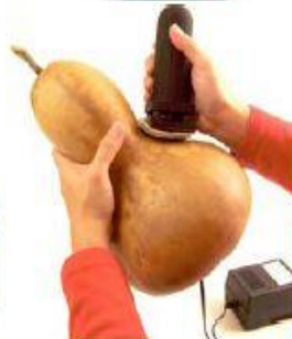
Our miniature power tools fit comfortably in your hand