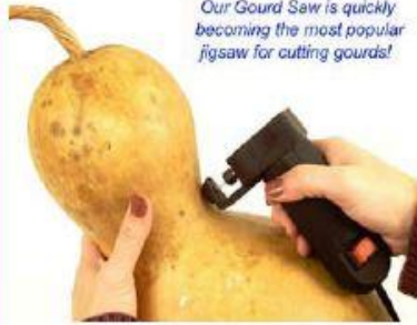
Our Gourd Saw is quickly becoming the most popular jigsaw for cutting gourds!