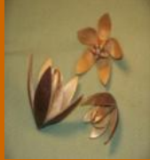
Wild lily pods