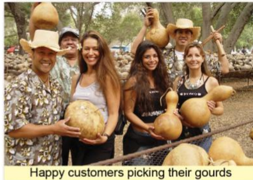
Happy customers picking their gourds