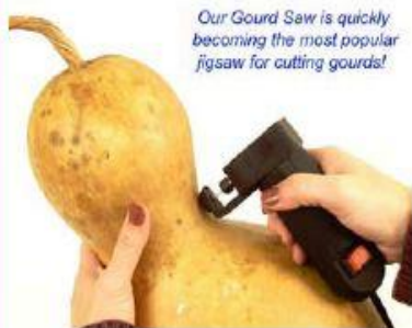
Our Gourd Saw is quickly becoming the most popular jigsaw for cutting gourds!