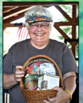
RAFFLE & SILENT AUCTION