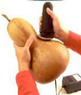
Our miniature power tools fit comfortably in your hand