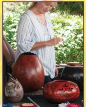
GOURD ART FOR SALE