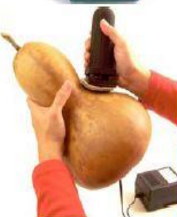
Our miniature power tools fit comfortably in your hand