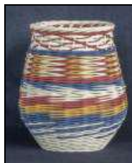
#209 Sunday – Color Play Instructor: Flo Hoppe – Rome, NY Materials & Preparation fee: $65 Intermediate