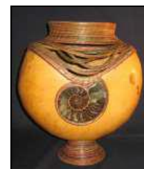
#208 Sunday – Gourd Sculpture Instructor: Audrey Fontaine – Monterey, CA Materials & Preparation fee: $35