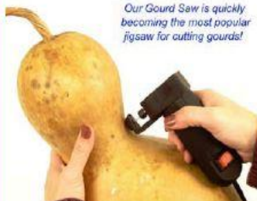
Our Gourd Saw is quickly becoming the most popular jigsaw for cutting gourds!