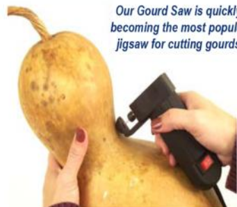
Our Gourd Saw is quickly becoming the most popular jigsaw for cutting gourds

Featuring the only power tools designed expressly for gourds!