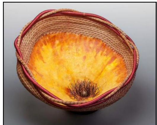
"The Poppy" Artist: Toni Best

For more complete details visit the Yerba Buena Center for the Arts website at: http://www.ybca.org/the-way-things-go