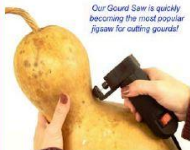
Our Gourd Saw is quickly becoming the most popular jigsaw for cutting gourds!