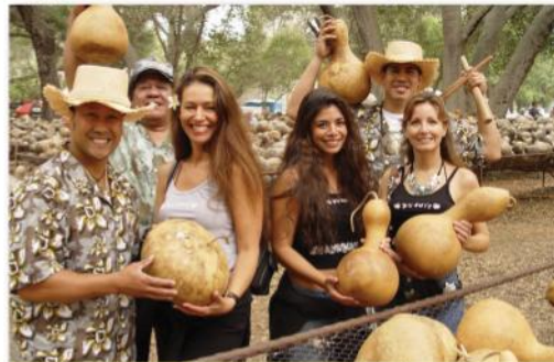
Happy customers picking their gourds